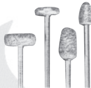
Top Row: 10x2.5mm, Cone